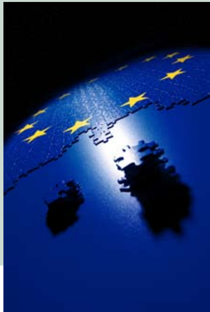
The European puzzle European Community © 2004

of the Union within tax and fiscal policy (WP 7) and within foreign and security policy (WP 6); and the multilevel configuration of civil society and the public sphere (WP 5). It examines the effects of external transnationalisation on the EU and discerns democratic lessons from comparison with non-European complex multilevel entities (WP 9). RECON studies the enlargement process and the transition and consolidation of democracy in the new member states (WP 8). The aim is to identify strategies through which democracy can be strengthened and propose measures for rectifying institutional and constitutional defects in different policy areas.