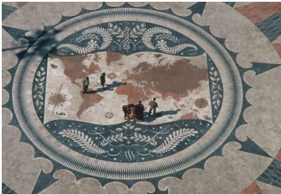
Lisbon - Monument to the Discoveries European Community © 1997