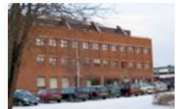
Sognsveien 68 ARENA located on 2nd floor