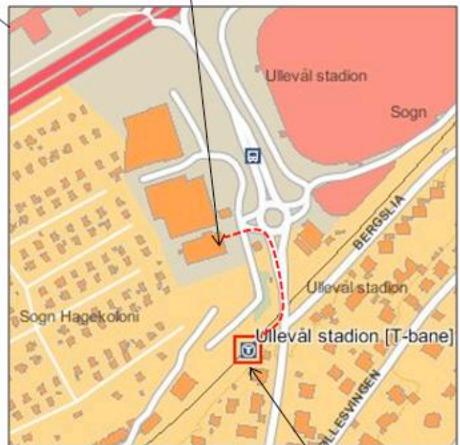
Subway stop "Ullevål Stadion"