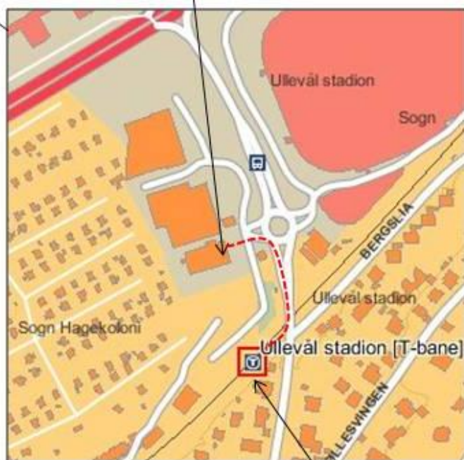
Subway stop “Ullevål Stadion”