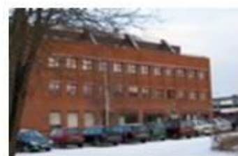
Sognsveien 68 ARENA located on 2nd floor