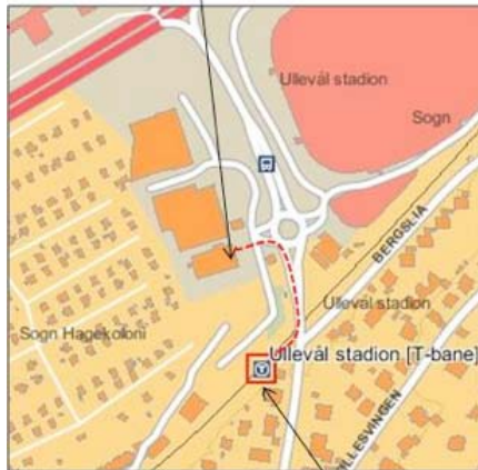
Subway stop "Ullevål Stadion"